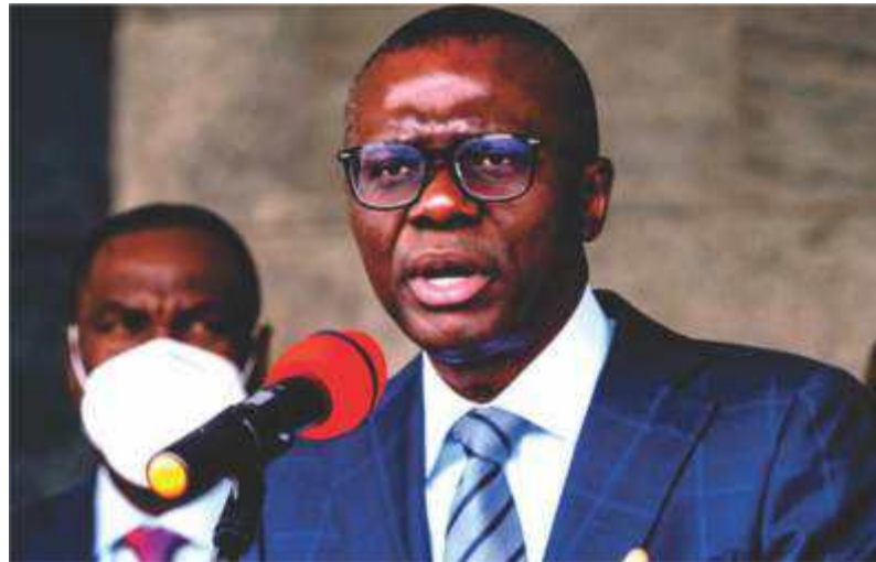
Gov. Babajide Sanwo-Olu

"As we mark this seventh anniversary, I want to assure Lagosians that the best is yet to come. We will not rest on