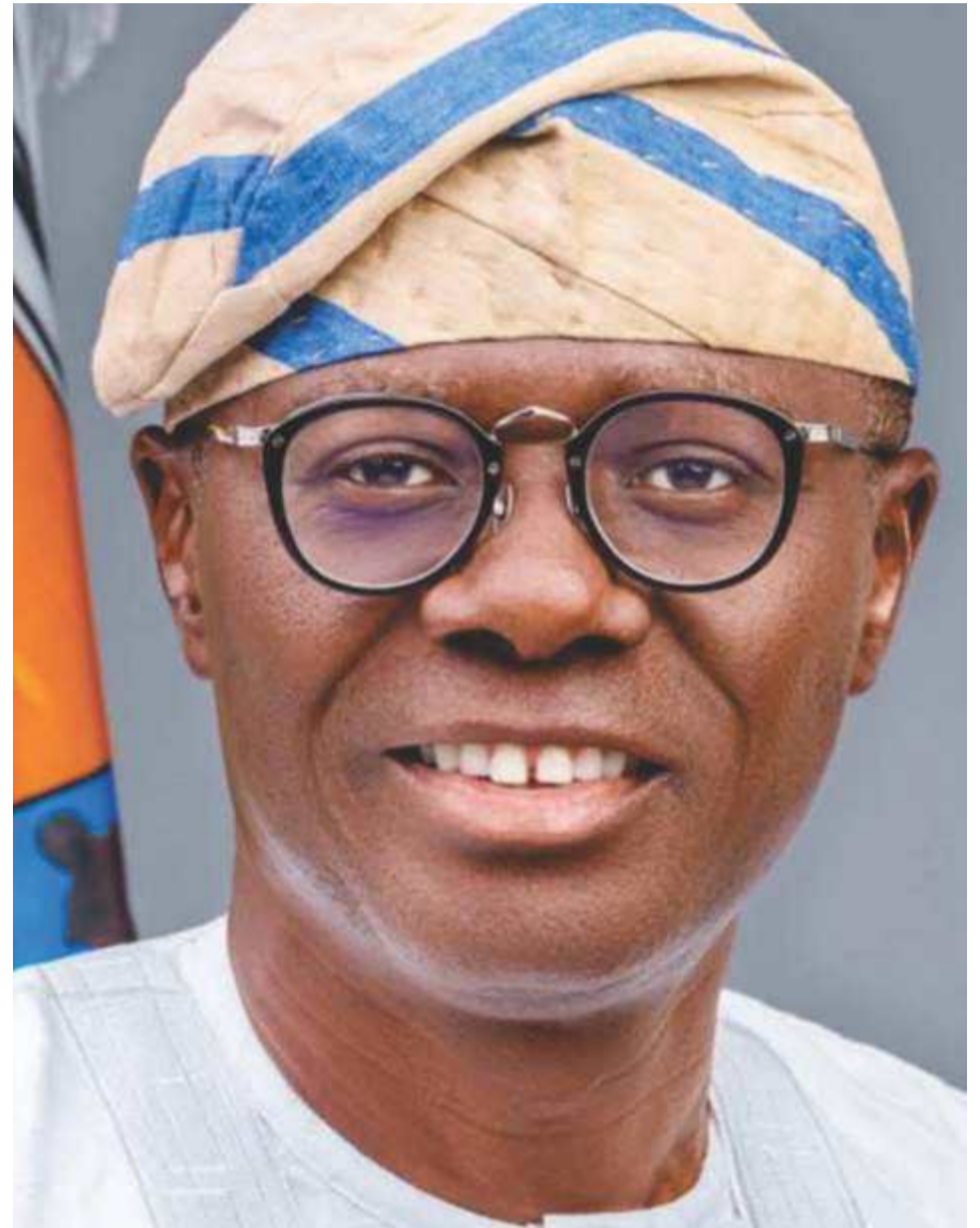
Mr. Babajide Sanwo-Olu