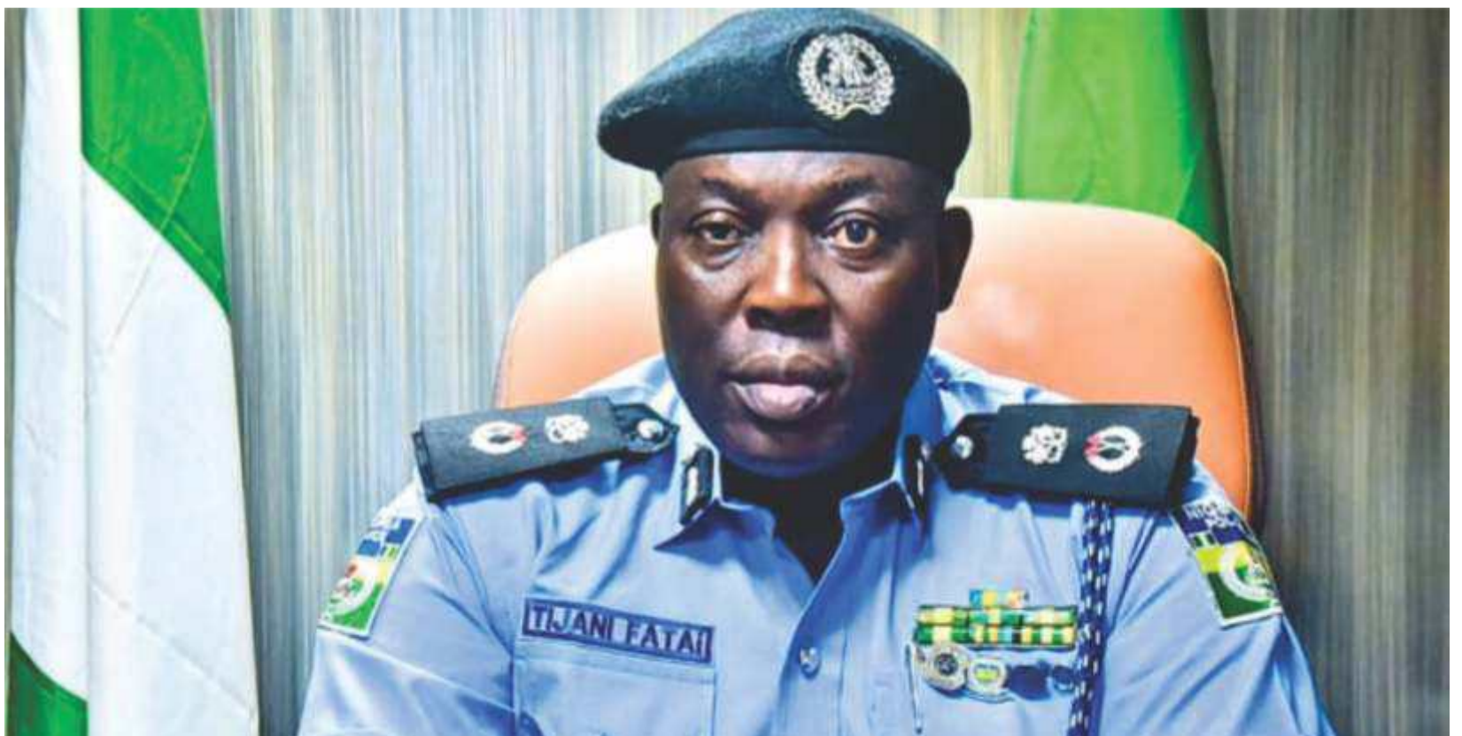
Security agencies Commissioner of Police Tijani

security personnel are properly equipped to respond effectively to emerging threats and maintain public safety across Lagos," Ogunsan said.