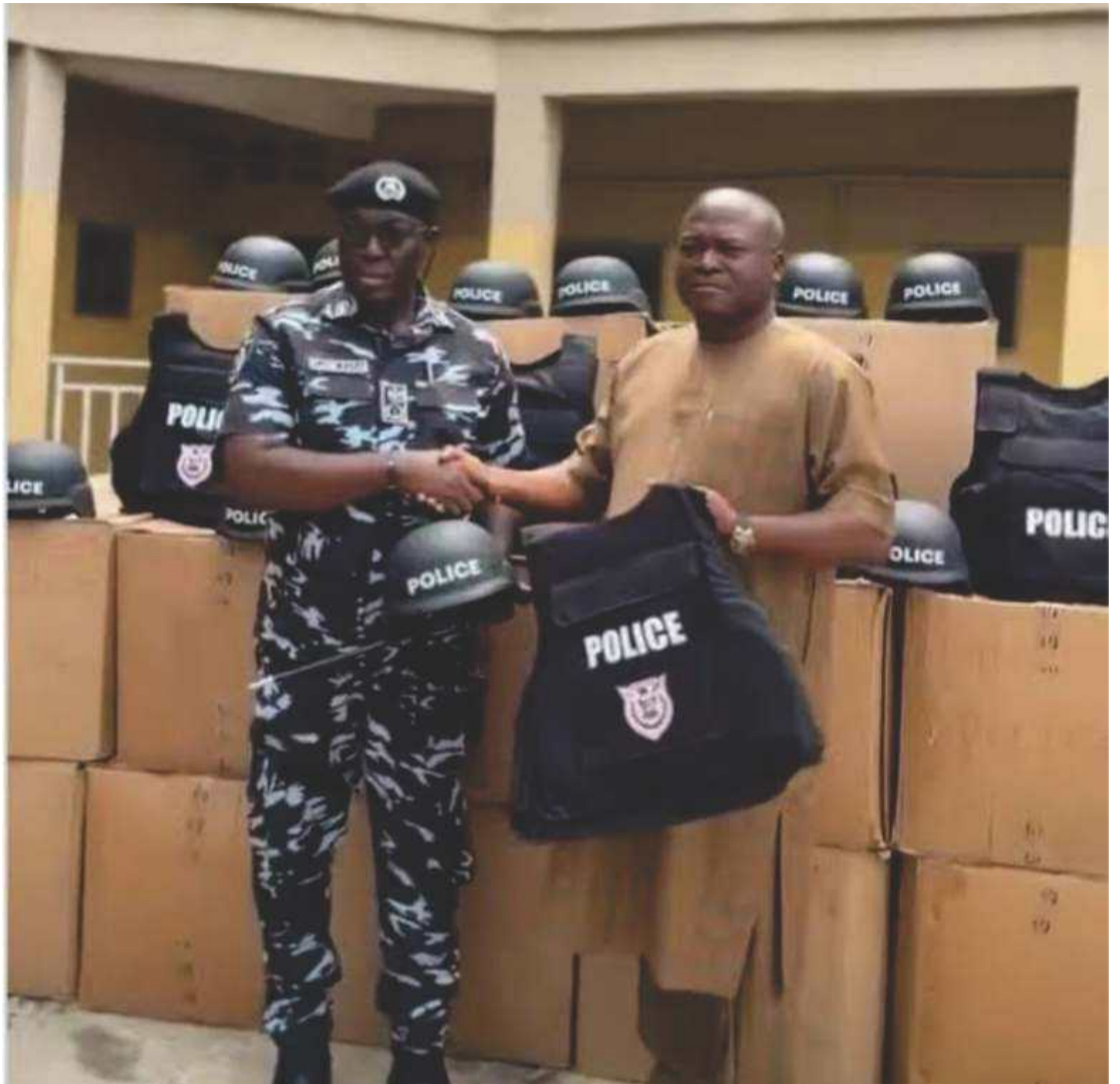
Presentation of bullet proof vest by LSSTF

Governor Babajide Sanwo-Olu also reiterated the state's commitment to supporting security agencies through the